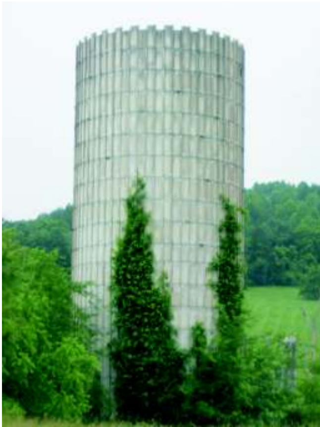
Tennessee Castle (a silo)