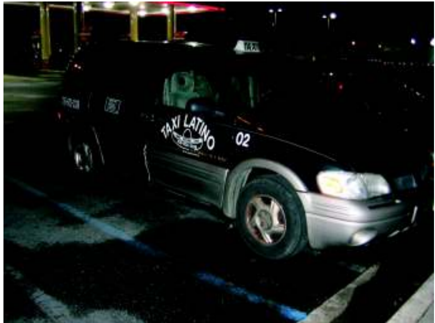
Taxi Latino in Georgia