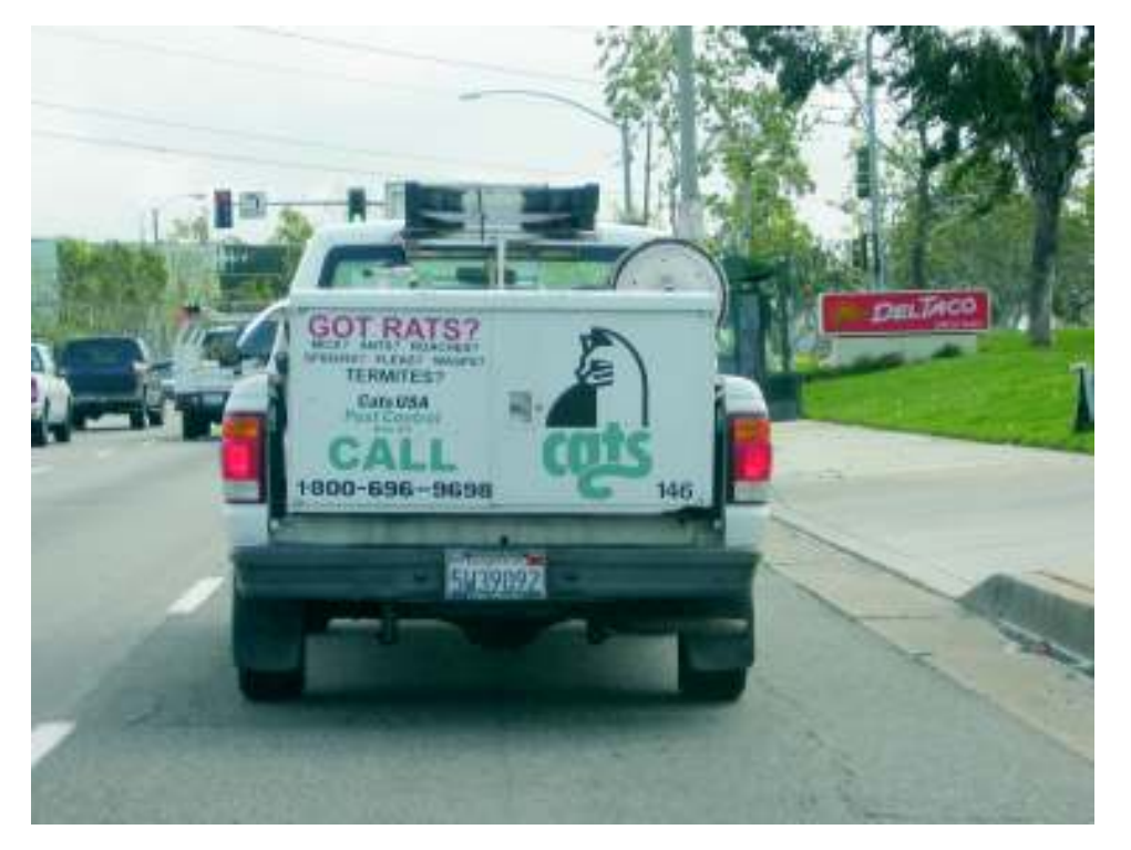
Page 7 of 9