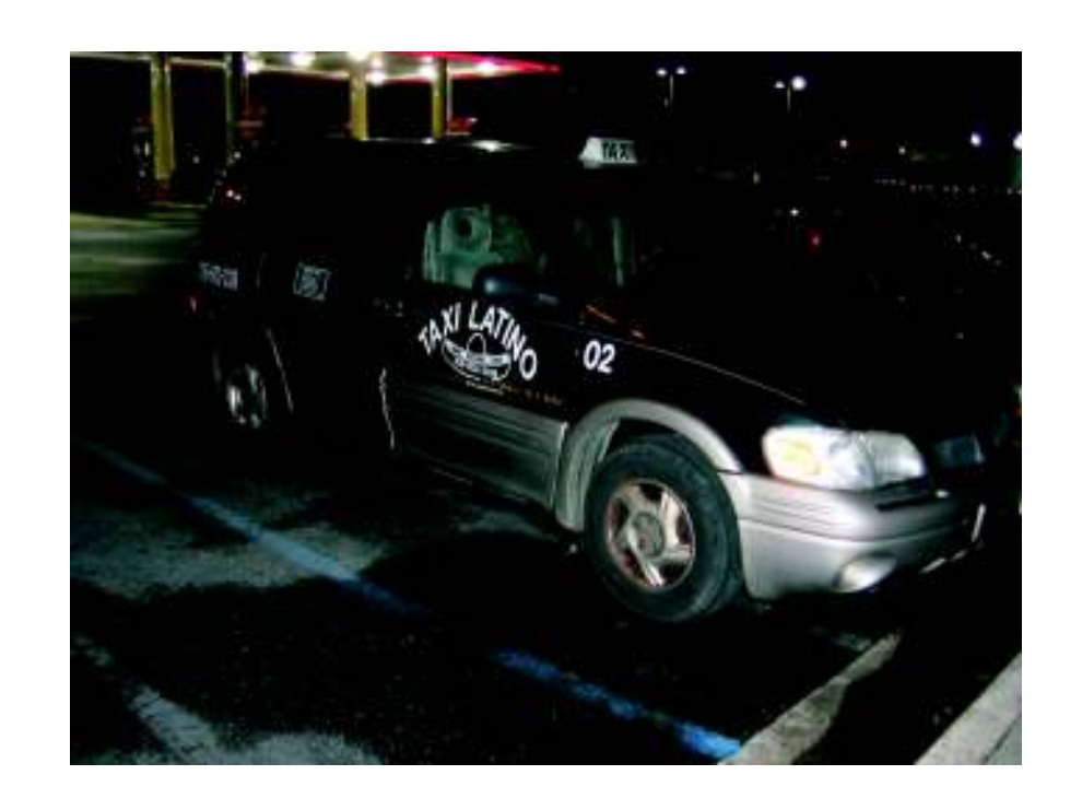
Page 4 of 9