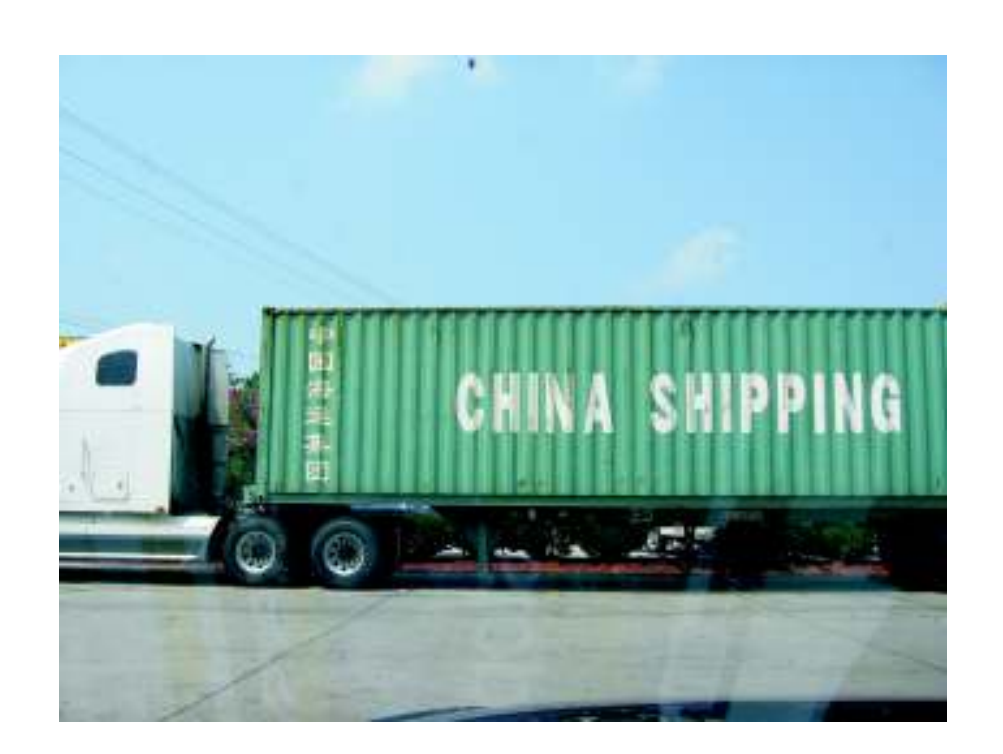
China Shipping in Florida