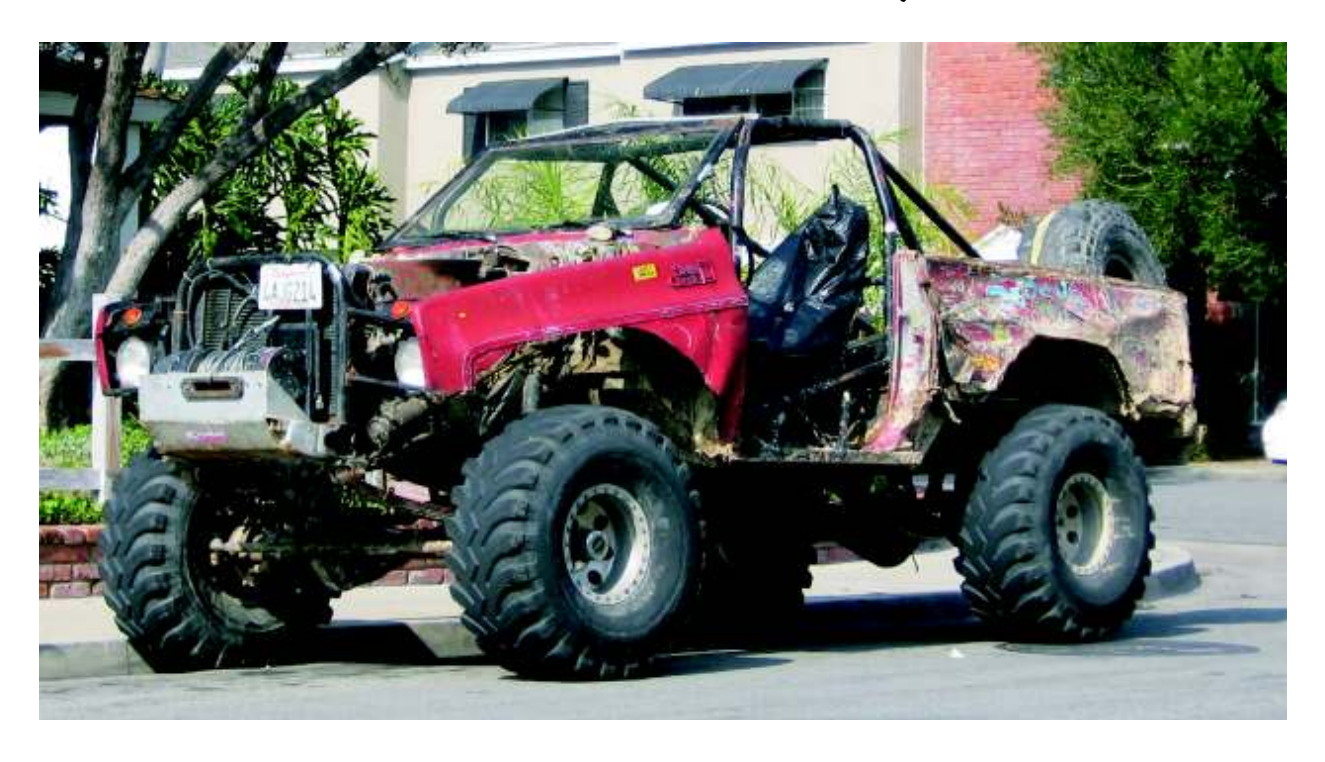
With age and experience one tends to accumulate a few scars.

Not all disputes are settled at the bargaining table.