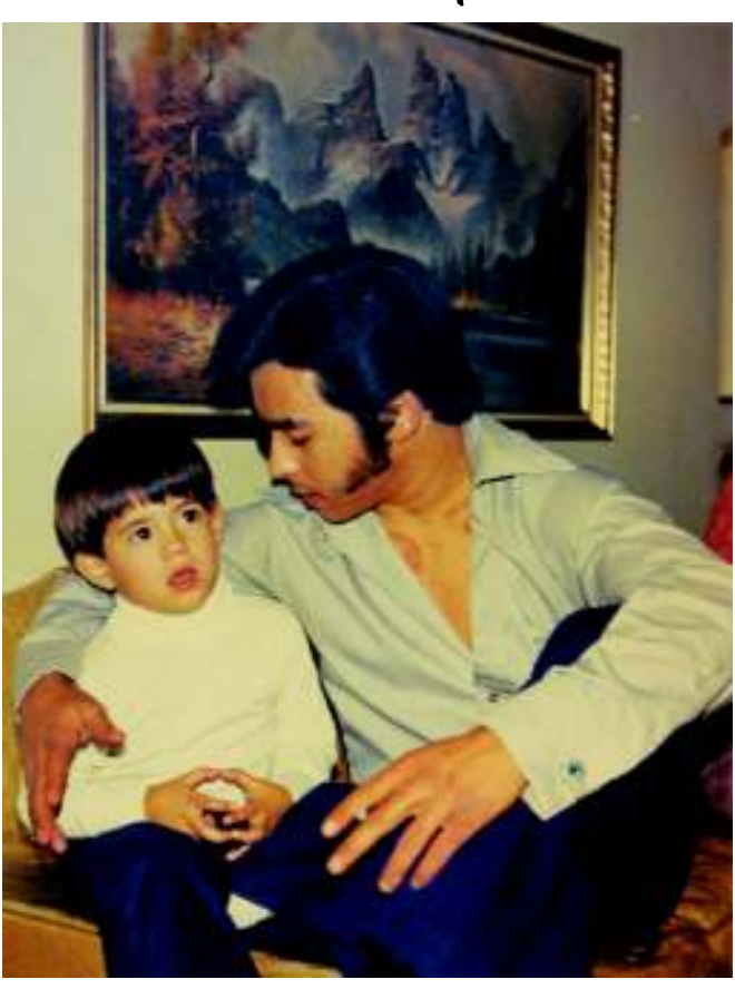
Tradition or Temptation?

While the two sides loudly urged their preferences, the "Evil One" attempted to directly influence the decision. But, tradition prevailed, and everyone had to wait until midnight.