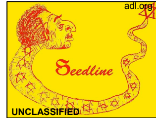
(U) Christian Identity symbol.

(U) Christian Identity (U//FOUO) A racist religious philosophy that maintains non-Jewish whites are “God’s Chosen People” and the true descendants of the Twelve Tribes of Israel.